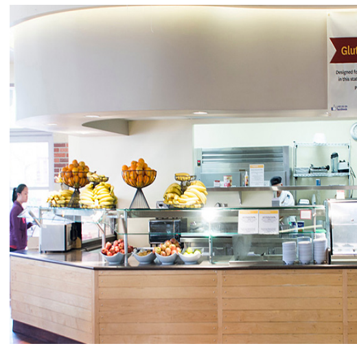
Parkside Restaurant & Grill

USC Hospitality offers an exclusive meal plan for International Academy students. The International 60 Meal Plan can be used in any of three all-you-can eat cafeterias inside the USC Campus.